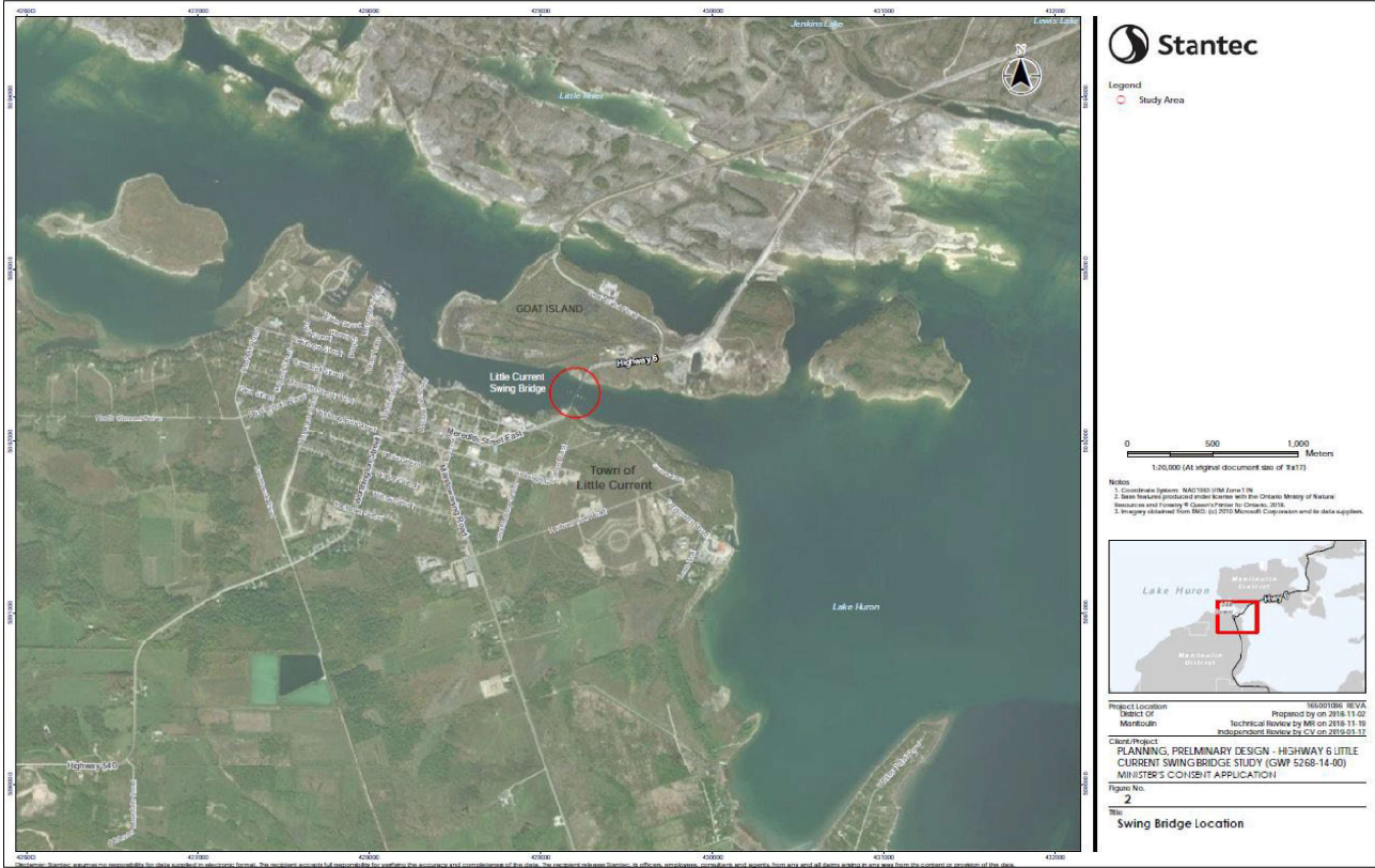
Figure1: Location of Highway 6 Little Current Swing Bridge circled in red

Part of the Shore Road Allowance aka Part of Water Street, Town Plot of Shaftesbury, now town of Little Current, being part of PIN 47122-0890 (LT) and Part of Water Lot being part of Little Current Channel between Goat Island & Manitoulin Island and Part of Water Lot K.G.37 Adjoining Goat Island District of Manitoulin, As shown outlined in red on the attached sketch (See Figure 2 below)